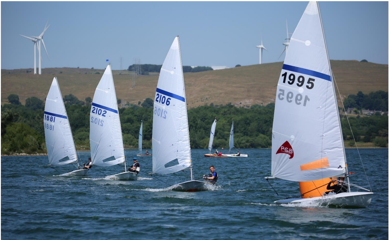
Sunshine at Carsington.