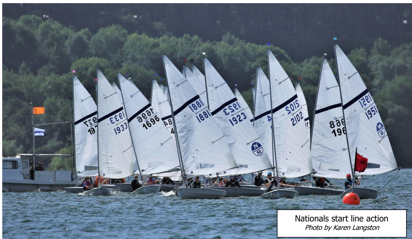
Nationals start line action

A newsletter circulated to all members of the Streaker Class Owners Association