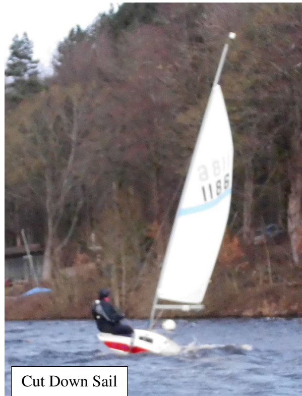
Cut Down Sail

The Wave sail standardized a smaller sail for the Streaker, which allowed clubs to allocate a PY handicap to the sail. The approximate sail area being 6 square metres and an estimated PY handicap of 1190.